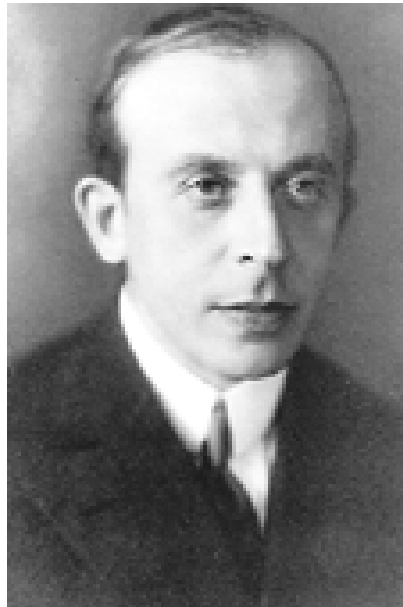
Richard von Mises 1883-1953

Von Mises invented the theory of collectives