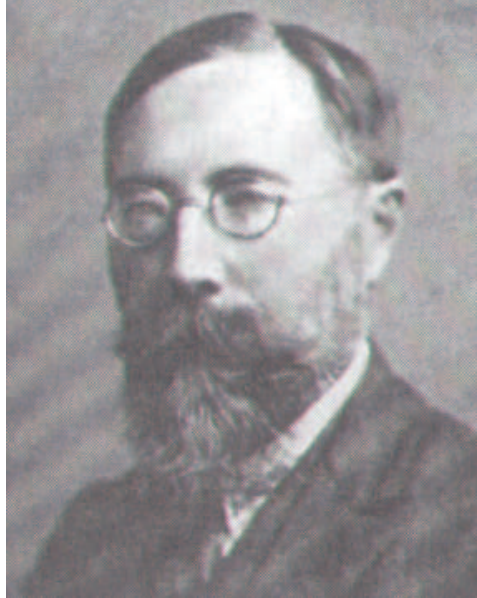
Aleksandr Chuprov 1874–1926

Only Chuprov came close to repeating Cournot's claim that the the principle of moral certainty is the meaning of probability.