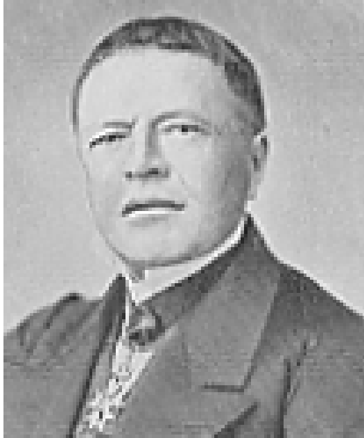
Antoine Cournot 1801–1877

Maurice Fréchet, 1878–1973, proposed the name Cournot's principle .