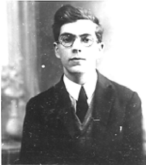
Jean Ville, 1910–1988, on entering the École Normale Supérieure .

In 1939, Ville showed that Cournot's principle can be restated as a principle of market efficiency: