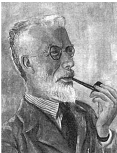
Ronald Fisher 1890–1962

In spite of his insistence on frequentism, Fisher still saw the “fiducial” aspect of probability.