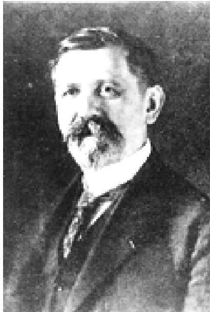
Émile Borel 1871–1956