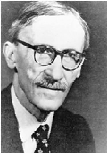
Paul Lévy 1886–1971

Paul Lévy was the first to make the point absolutely clear: Cournot's principle is the only connection between probability and the empirical world.