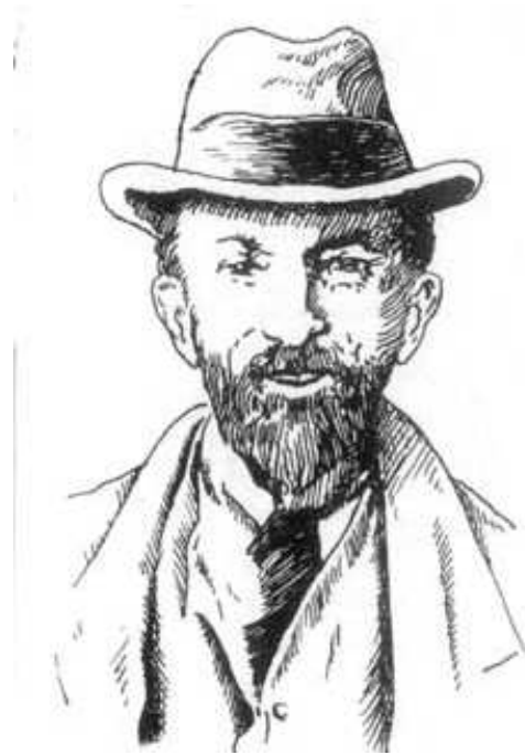
Jacques Hadamard 1865-1963