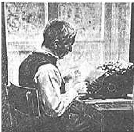
Andrei Kolmogorov 1903–1987 The Soviet Euler

In his Grundbegriffe (1933), Kolmogorov gave two principles for connecting probability with the empirical world: