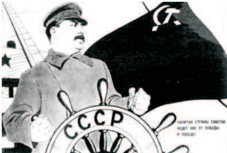
Joseph Stalin 1879–1953

Connecting probability theory with the real world (statistics) was dangerous under Stalin.