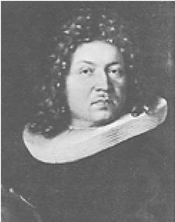
Jakob Bernoulli 1654–1705

Bernoulli related mathematical probability to moral certainty in his celebrated Ars Conjectandi (1713).