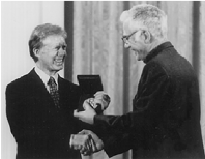
Joseph Doob, 1910–2004, receiving the National Medal of Science from President Carter in 1979.

Picking up where Kolmogorov left off, and systematizing Wiener, Doob showed how continuous random processes (e.g., Brownian motion) can be put in the measure-theoretic framework.